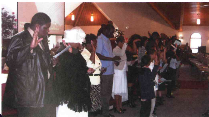
The baptismal vows were presented to the candidates.

The Bridgeland Seventh-day Adventist Church saw this prophesy come to life as the church turned into “Festival City,” the place to be during the Better Days are Coming Gospel Festival. International Evangelist Pastor Samuel Telemaque was sent to Bridgeland to wake up the church members, and indeed he shook the place upside down. From October 4 – October 25, 2008, “Festival City” was on fire for Jesus. Lives were transformed as 59 souls responded to the call of salvation and were either baptised for the very first time or recommitted their lives to God in baptism a second time.