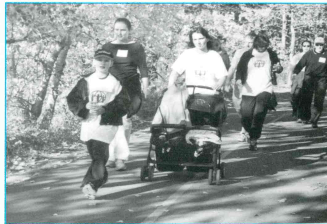
Calgary Central Walk-a-thon