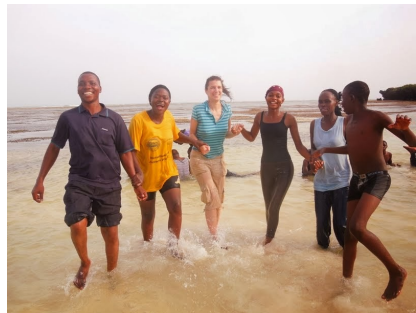
Having fun in December at the beach!