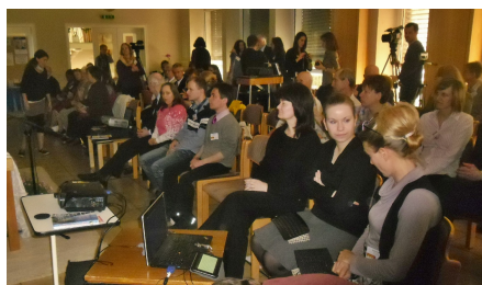
There were two Finish text transcribers with the Finish delegate- the text was projected on the screen for all to see. The German HOPE - SDA TV was there, too!