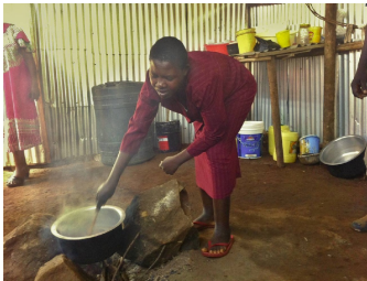
Cooking for the deaf students