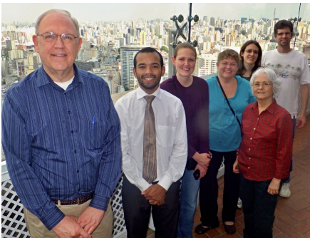
The group of deaf ministry leaders and interpreters from the USA who met with 170 leaders and deaf members from Brazil during a special seminar there Plus their Brazilian interpreter!