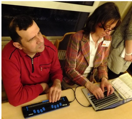
An Electronic Braille system being used by the man who was both deaf & blind during the German 95 Deaf Anniversary