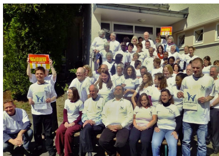
Group picture with the special T-Shirts showing the new General Conference Deaf Logo - see opposite page for larger view