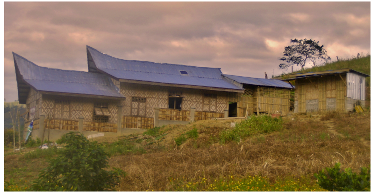
Mindanao Deaf School Residence, Kitchen and Latrine kind.

Many more churches we visited gave whatever they have in