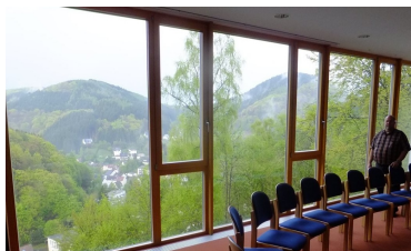
A View of the area in Germany where the 95 th was held as viewed from the retreat center