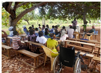
Mostly the group met outdoors!