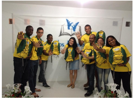
Enthusiastic members of the Deaf group in Brazil with their deaf imprinted clothing and Logo