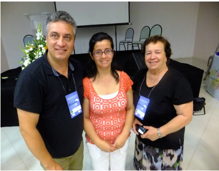
A Deaf family from Chile who drove for several days to attend the special Deaf Seminar weekend in Brazil