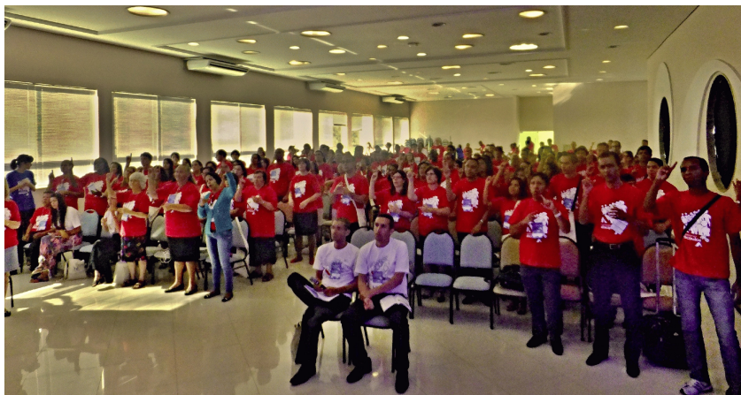
Wonderful Meeting of SDA Deaf from 6 countries in Sao Paulo, Brazil