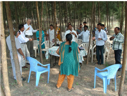
The Deaf GO workers sign singing outside during their training workshop. There are a total of about 20 GO Lay workers for the deaf in India