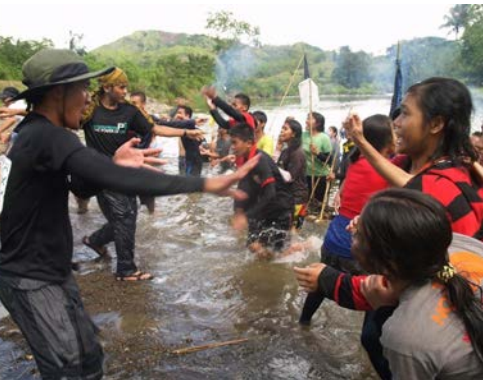
Looks like a Fun Time 'Water Fight' During the Mindanao Deaf Camp Recreation Time