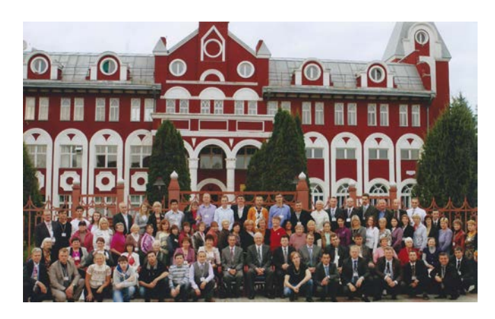
West Russian Congress for Deaf with 107 Deaf in attendance

(Some of the pictures received after the main newsletter was set up)