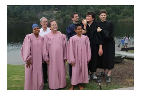
Baptism At 2013 Cohutta Deaf Camp Southern Deaf Fellowship