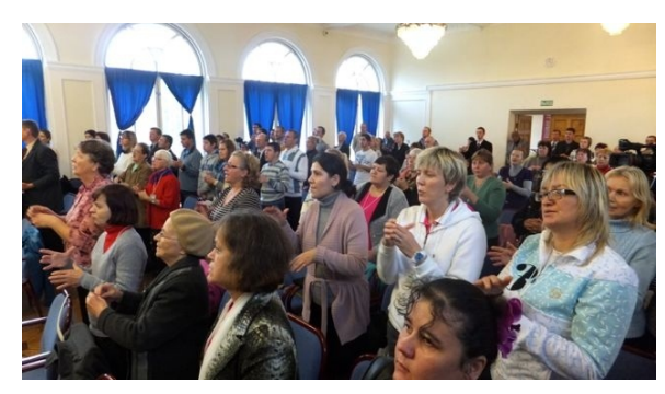
Congregation at the Russian Deaf Congress in Sept., 2013