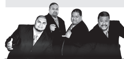
Keepers of the Faith Quartet Sunday, July 14, 7 pm | Main Auditorium

Adult Supervision must be provided to overnight guests under the age of 18.