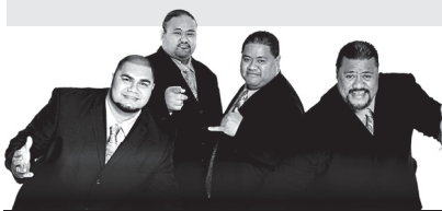
Keepers of the Faith Quartet Sunday, July 14, 7 pm | Main Auditorium

Adult Supervision must be provided to overnight guests under the age of 18.