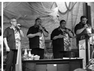
Keepers of the Faith quartet