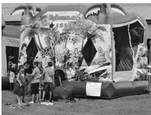
Bouncy castle family fun day