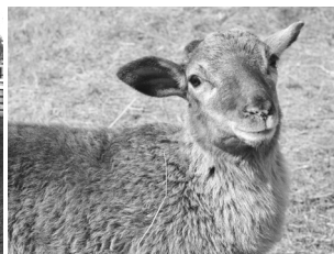
"Mukluk" the sheep at the petting zoo