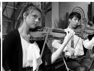
Making music with the orchestra