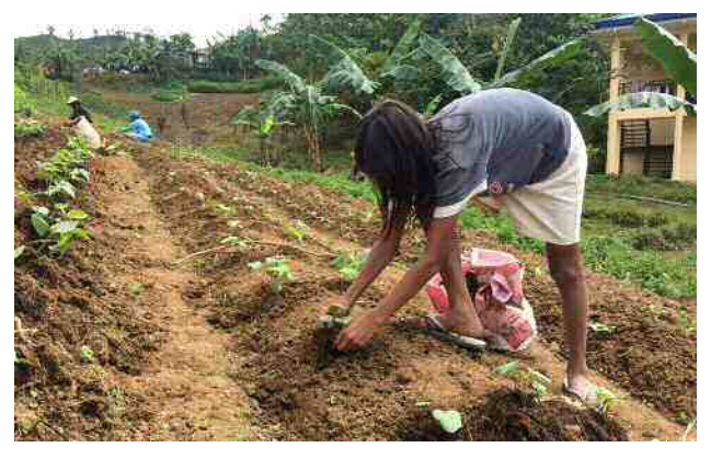
SULADS Deaf School's Garden Growing Well!