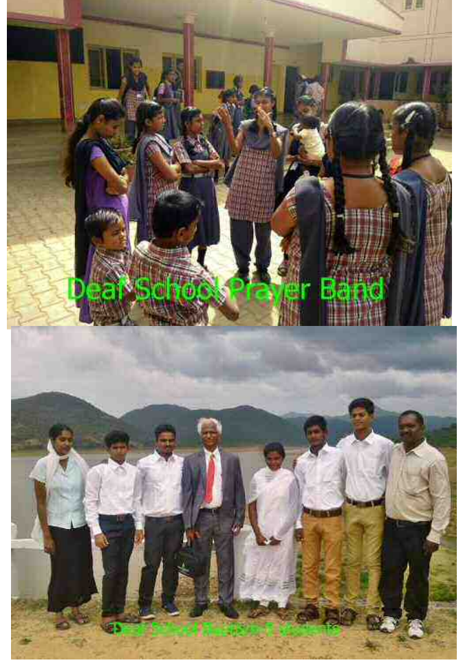
INDIA: After a Spiritual Emphasis week, 5 Deaf students were baptized - where it is a major stand in Hindu area