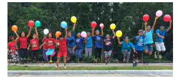
Philippine SULADS Deaf Students Celebrating