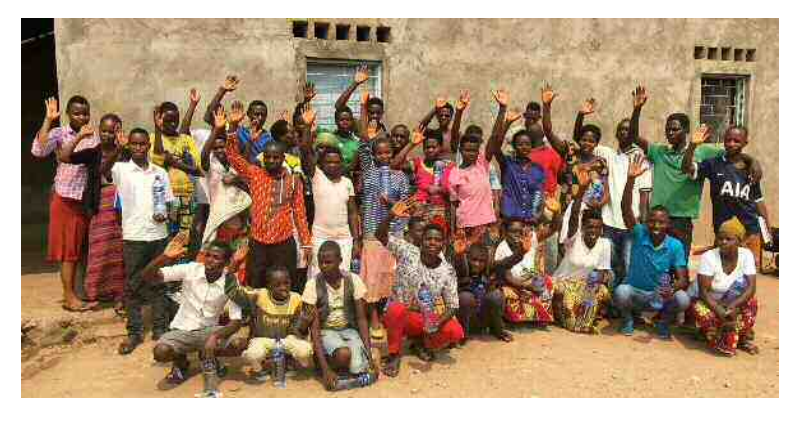
A fairly new country to GO, Burundi (above) with many new baptisms is blessed with a very active deaf GO worker for the Deaf.

At Gospel Outreach we have a special "Deaf New Work Development Fund" . One of the reasons why we have recently been able to enter a number of new countries is because of this fund. This fund has been especially blessed with some major donations- but we need all sizes of donations!