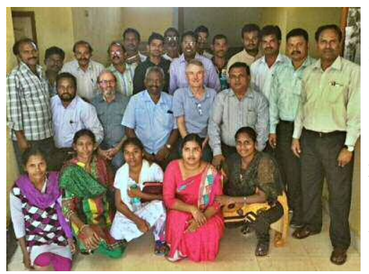
GO Worker India Training Session