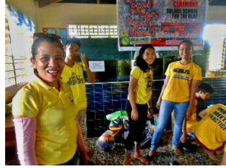
Students in the "Lending" program

There are good things happening at the Philippine SULADS Deaf School. The students have been involved in a community service program called "Lend an Ear- Lend a Hand". This takes students out to perform acts of kindness and help in the surrounding community.