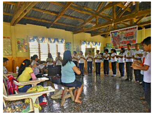
Deaf Students at the SULADS Philippine Deaf School

There are good things happening at the Philippine SULADS Deaf School. The students have been involved in a community service program called "Lend an Ear- Lend a Hand". This takes students out to perform acts of kindness and help in the surrounding community.