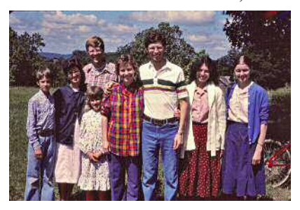
Deaf choir before baptism at Milo camp