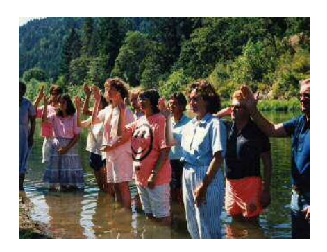
Deaf Retreat - Kananaskis Park, AB