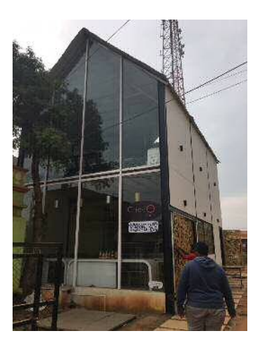
The bakery above is set up in the town of Kollegal near the main SDA deaf school which has been in operation for over 15 years.

The following pictures show their bakery, some of the product and how they can sell items made!