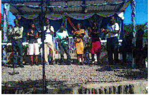
Youth Signing a special in Zimbabwe