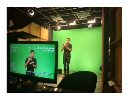
Recent Taping of the Missionary Book of the Year in Sign Language in Brazil

"I understood much more about Hell better...thank you very much for me to learn about truth." (New Jersey)