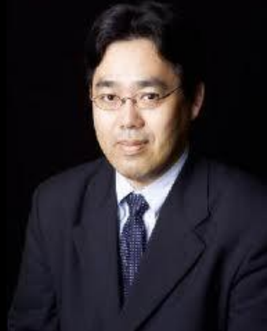
Dr. Ryuta Kawashima

In contrast, arithmetic stimulated brain activity in both the left and right hemispheres of the frontal lobe - the area of the brain most associated with learning, memory and emotion.