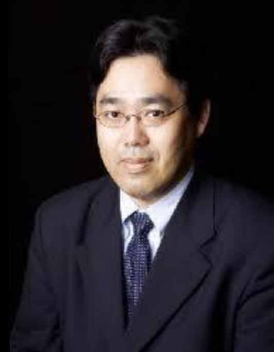
Dr. Ryuta Kawashima

http://www.guardian.co.uk/world/2001/aug/19/games.schools